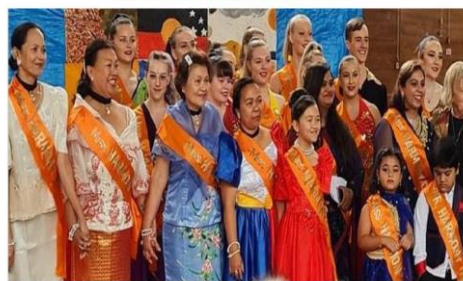
Join us in traditional costume and enjoy our program of cultural displays, singing and dancing

COME ALONG AND ENJOY FRIENDSHIP FROM THE DIVERSE CULTURES THAT WE ARE FORTUNATE TO HAVE IN GLEN INNES